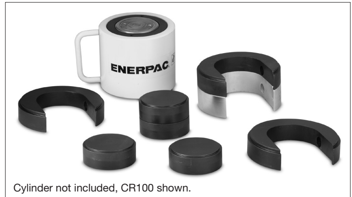
Cylinder not included, CR100 shown.

WARNING: The system operating pressure must not exceed the pressure rating of the lowest rated component in the system. Install pressure gauges in the system to monitor operating pressure. It is your window to what is happening in the system.